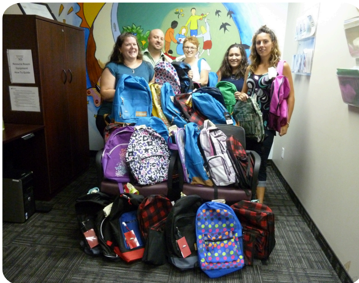
SCS Backpack Drive