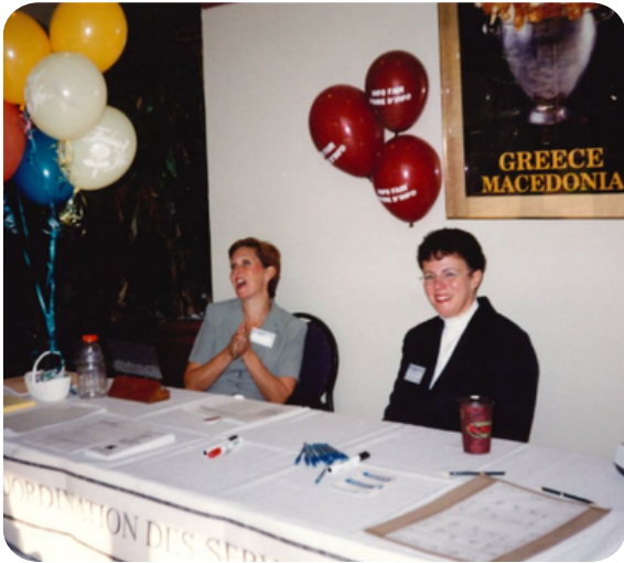
SCS Tabling at a Resource Fair