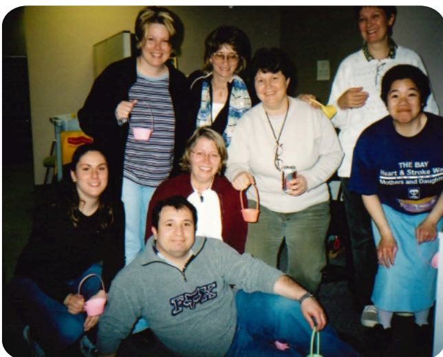
Office Days at SCS