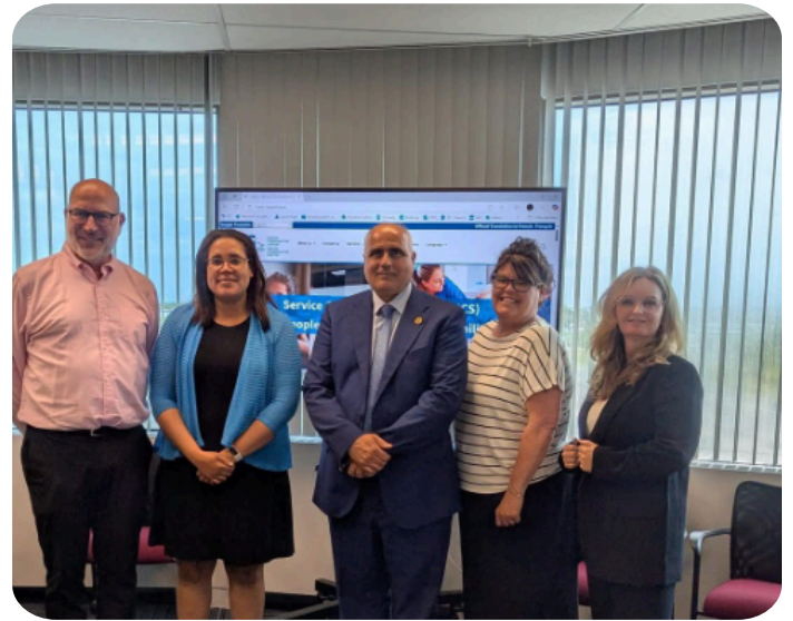
SCS TAG Community Event