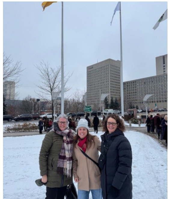
(Photo: SCS and DSOER staff pose in front of City Hall after attending a City of Ottawa event for International Day of Persons with Disabilities)