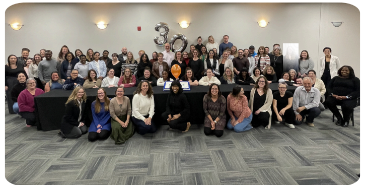
Staff Recognition Event and 30 th Anniversary Celebration