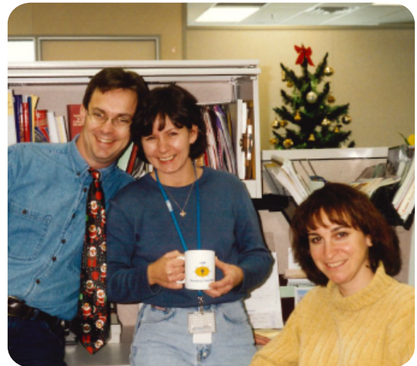
Early Office Days at SCS